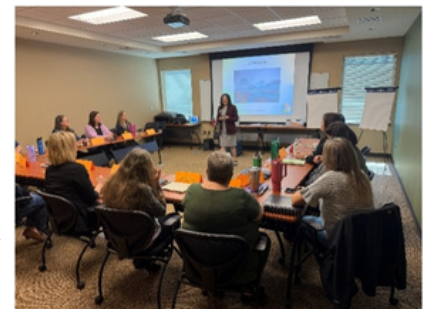
WAPDD at True Colors Training with UADA Extension

Many EDDs have limited capacity for internal professional development. However, when WAPDD leadership recognized the need to reenergize staff and improve internal communication, it worked with UADA Extension to deliver the True Colors training. This program, facilitated by UADA Extension staff, uses personality assessments to help teams understand how communication styles and motivations impact workforce dynamics.