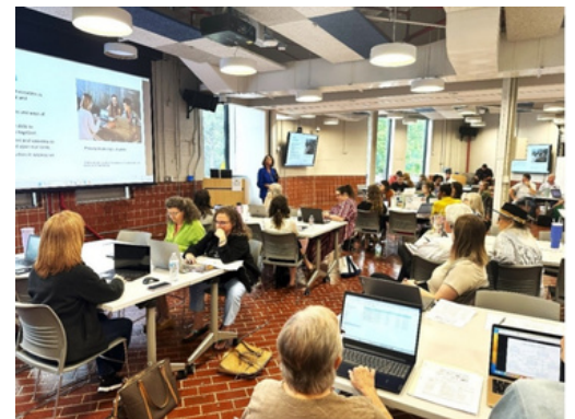
Sebastian County Capacity Building for Grant Writing Training