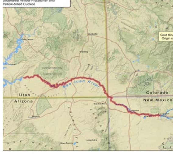
Endangered Species Critical Habitat for Colorado Pikeminnow, Razorback Sucker, Southwest Willow Flycatcher and Yellow-billed Cuckoo