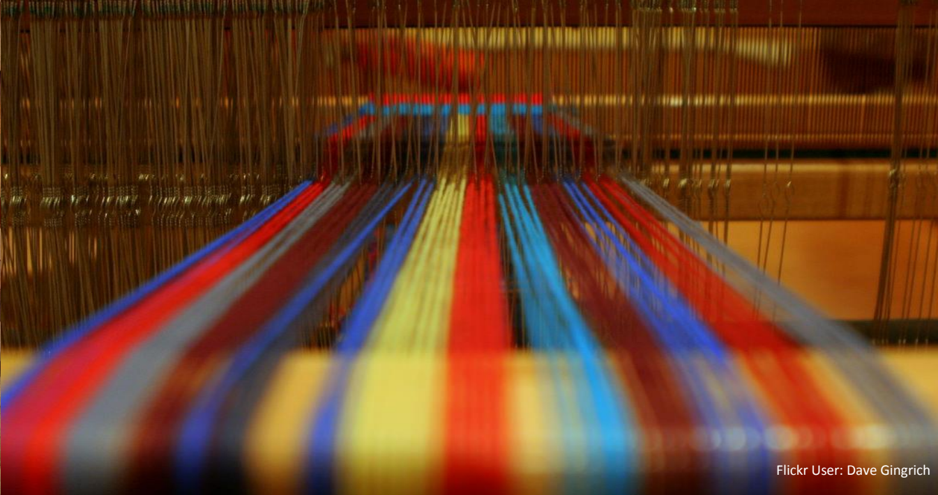
Flickr User: Dave Gingrich