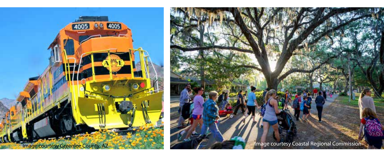
Integrating Economic Resilience into Performance-based Transportation Planning

For organizations that are new to measurement or updating their measurement plan, the wealth creation framework may offer insights on measuring various transportation impacts on community resilience. Transportation can link to and support a number of different forms of capital, and some of these may be worth measuring over time and using to prioritize among competing needs. Thinking through transportation's effect on community capital and the linkages to other types of investment can be fruitful for improving economic resilience. The exact measures chosen by transportation agencies will vary according to their vision and locally developed strategies.