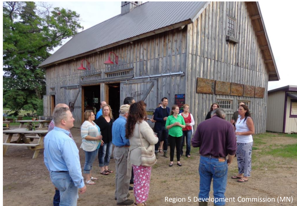
Region 5 Development Commission (MN)