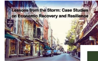
Lessons from the Storm: Case Studies on Economic Recovery and Resilience

Greater New Orleans: Building on Competitive Advantages to Strengthen Economic Resilience