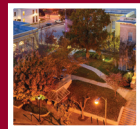
NADO Annual Training Conference

Please visit NADO.org/events to learn more about these conferences and other events that we host throughout the year.