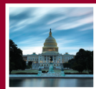
Washington Policy Conference: NADO on the Hill