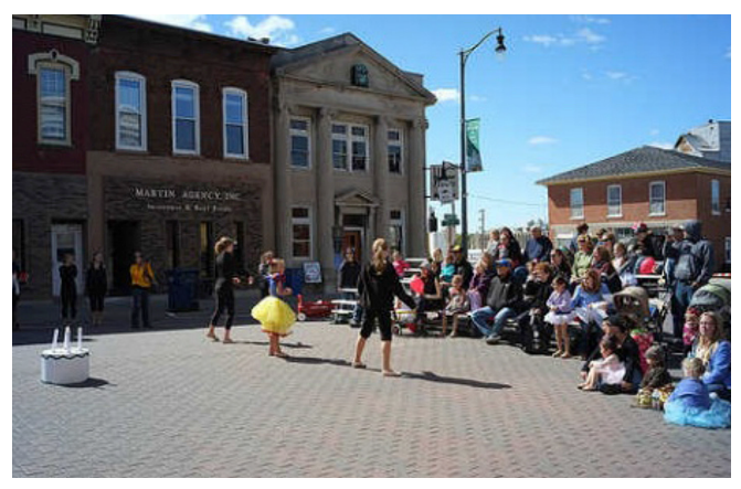
An event taking place in West Liberty, lowa, where changing street lights to high efficiency fixtures has saved the city 47% in energy costs.

and efficiency projects. Most recently, they purchased a Chevrolet Volt (a plug-in hybrid) from the local dealer for use as the city manager's car. Changing street lights to high efficiency fixtures has saved them 47 percent in energy costs.