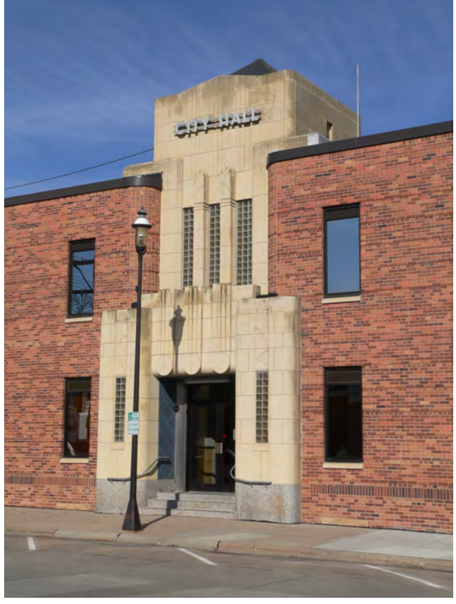
Energy audits were conducted on every municipal building in Kearney, Nebraska, including its City Hall.

In addition to purchasing electric vehicles, they have changed every traffic light to high-efficiency fixtures and are in the process of converting every streetlight. They have conducted energy audits of every municipal building and followed up with major weatherization, HVAC, and lighting improvements