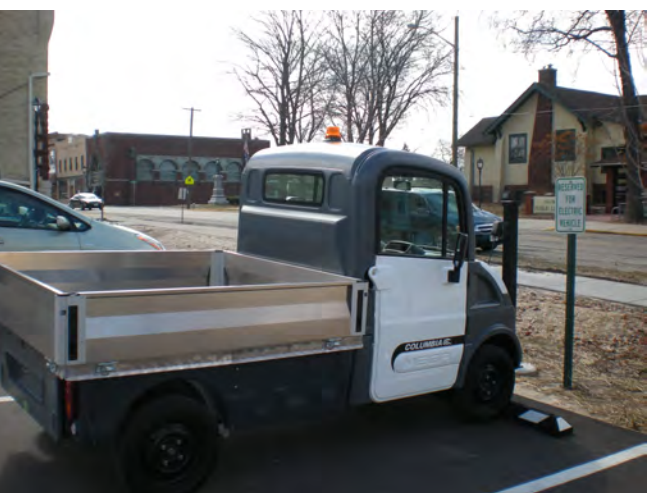
The City of Columbus' electric truck parked at a plug-in station. The truck will be used for park maintenance and public works functions.

Kraemer reports, when they hear that the city has all high-efficiency LED street lights. "We can turn them on with a laptop and we can change them in high crime areas." He says it gives them a media and attitude edge over other communities.