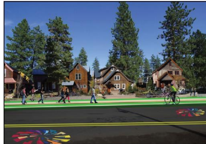
Figures 9 (left) and 10 (right). Before and after images of McCoy Lake Road looking toward existing housing.