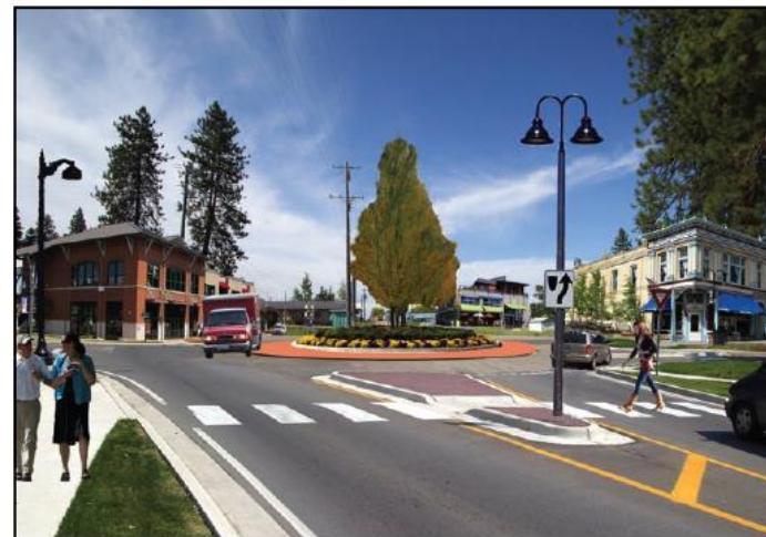
Figures 10 (left) and 11 (right). Before and after images of BIA Highway 27/Wellpinit Agency Loop/Ford Wellpinit Road with roundabout and new development. It was learned during the Sustainable Community Master Plan process that there was some acceptance for two-story development.