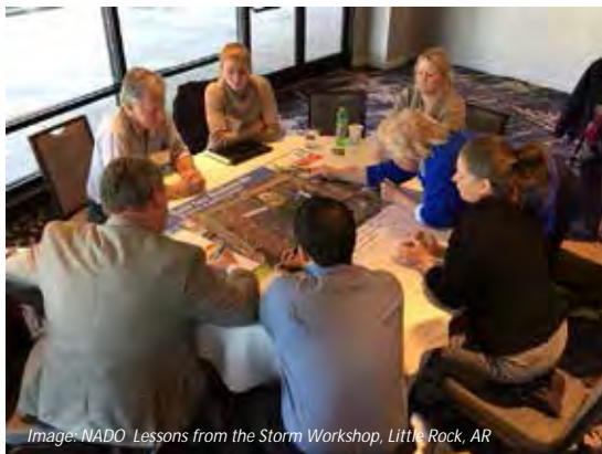
Lessons from the Storm Workshop, Little Rock, AR