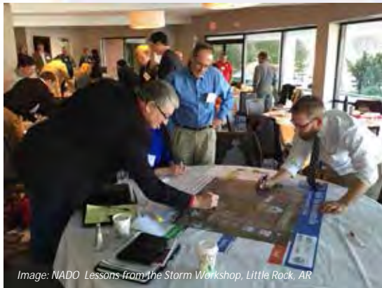
Image: NADO Lessons from the Storm Workshop, Little Rock, AR

The resource can only be made stronger with feedback from users like you !