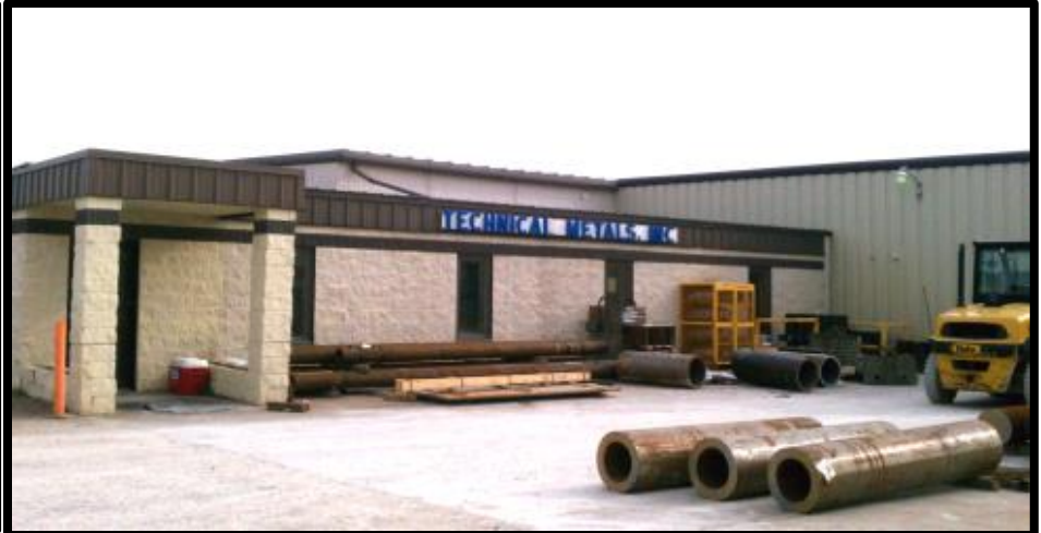
Technical Metals, Inc.