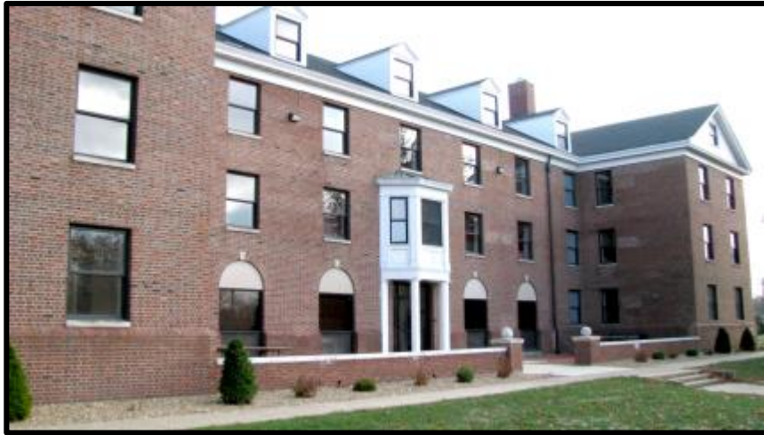
Prairieland Investment Group