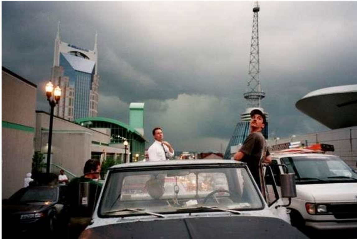
Crazy Tornado in 1998