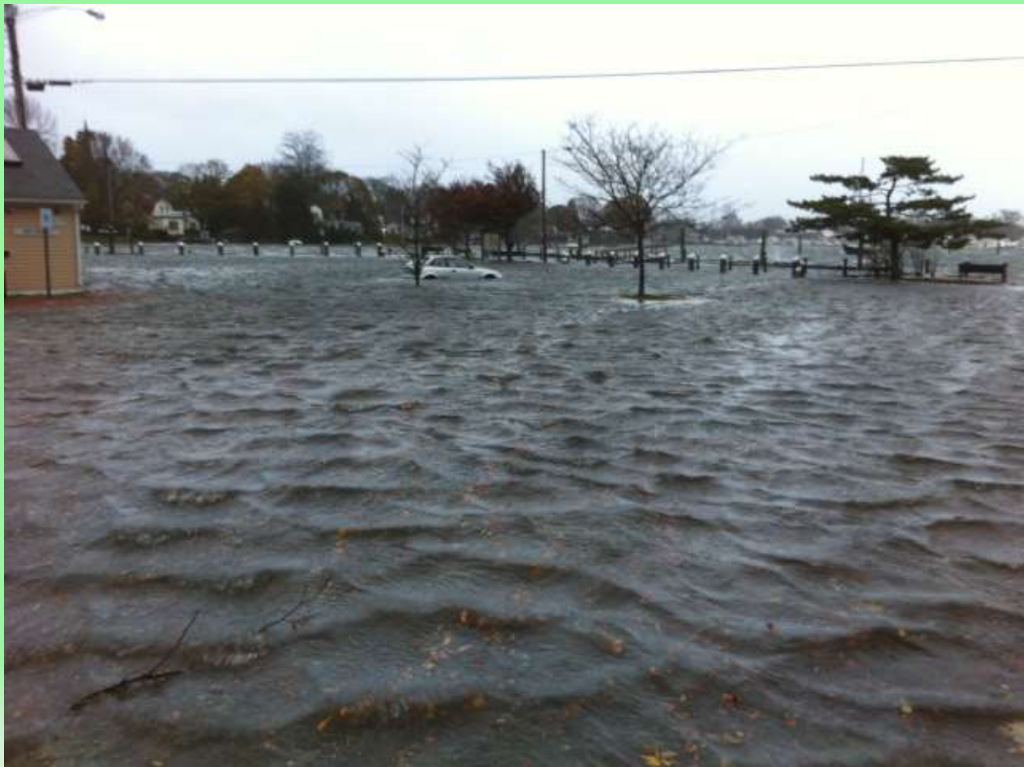
Wickford Village Dockside Parking Lot, North Kingstown, RI Super Storm Sandy October 2012