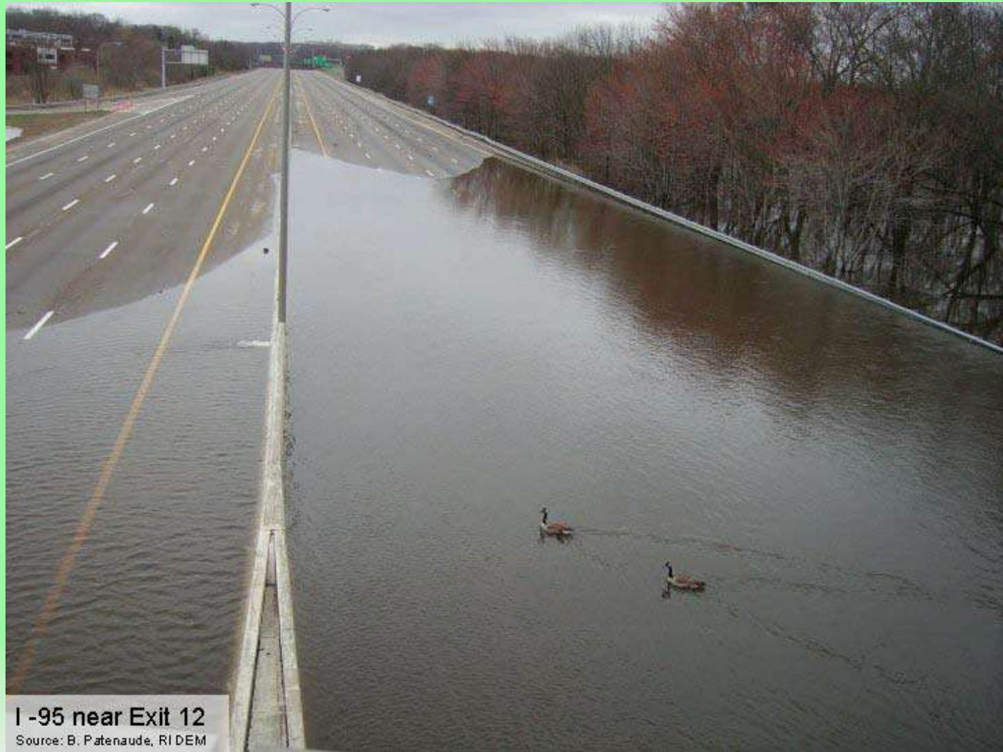
I -95 near Exit 12