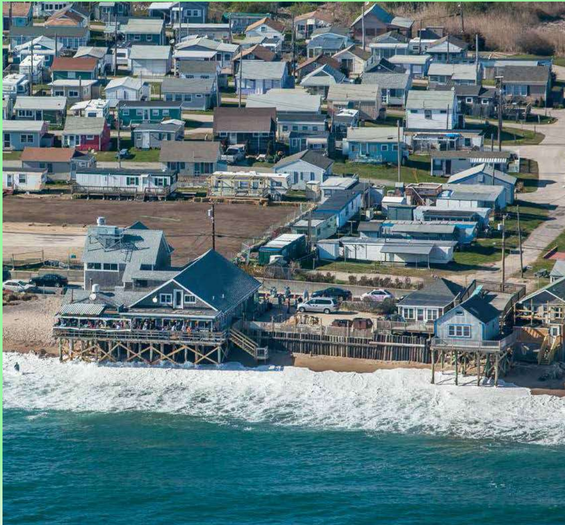
Matunuck Beach Road, Matunuck, Rhode Island