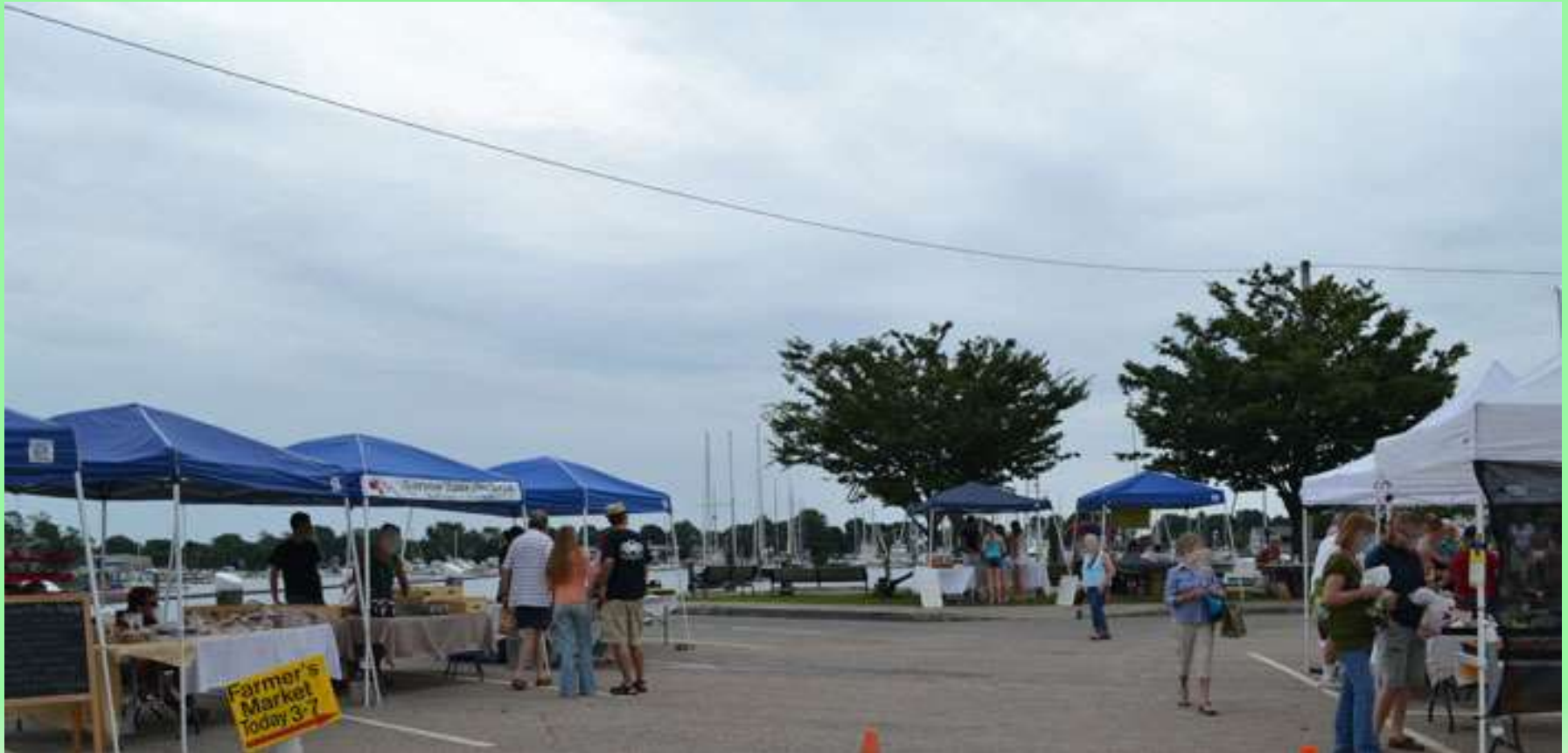
Wickford Village Docks Parking Lot, North Kingstown, RI Summer 2012