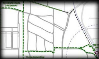
pedestrian and bike network