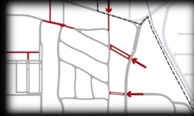
connectivity and accessibility