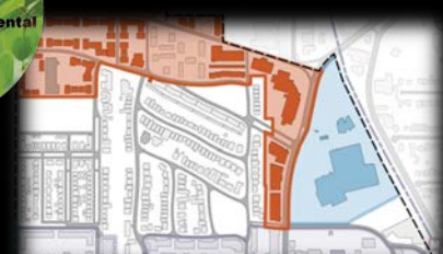
edges of neighborhood