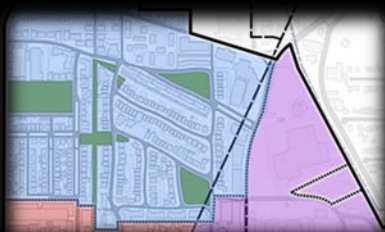
district redevelopment entity