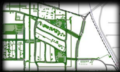
holistic green infrastructure