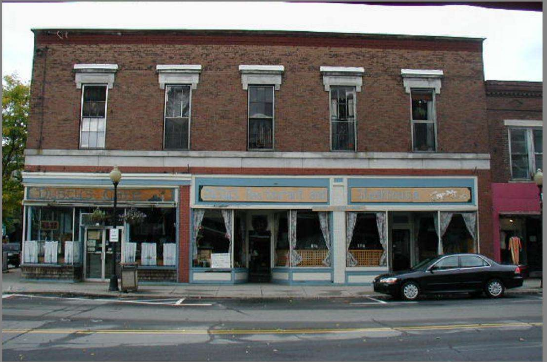
Brown Block West elevation 2005