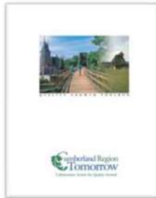
Cumberland Region Tomorrow Quality Growth Toolbox