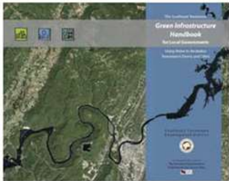
Southeast Tennessee Development District Green Infrastructure Handbook