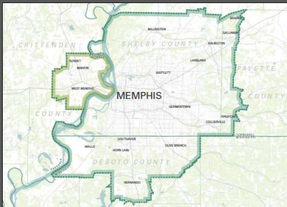
Study Area: Memphis MPO, West Memphis MPO