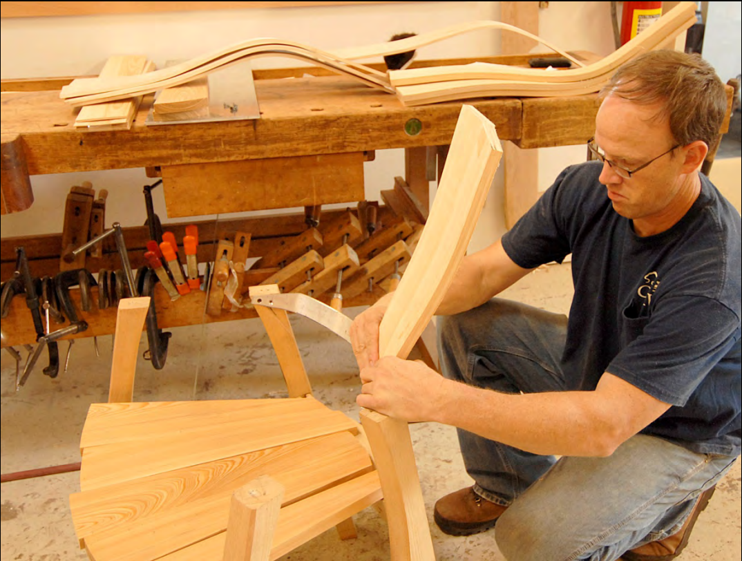
Turner HD Media