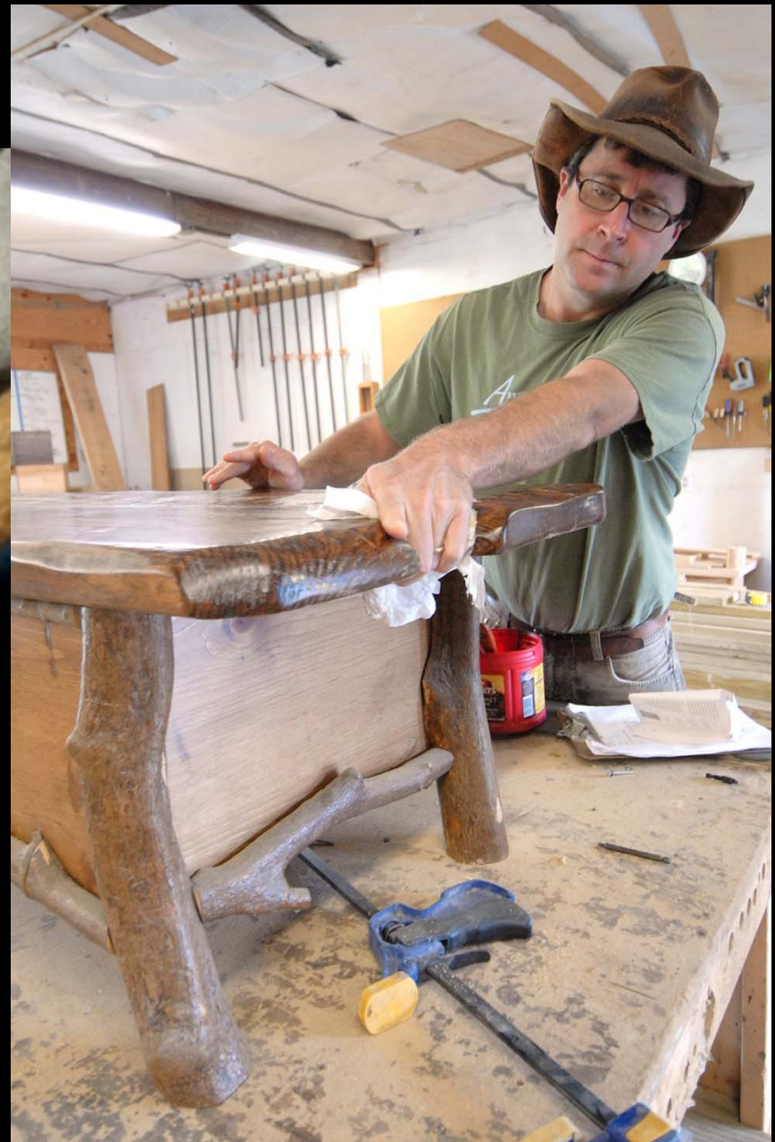
Turner HD Media