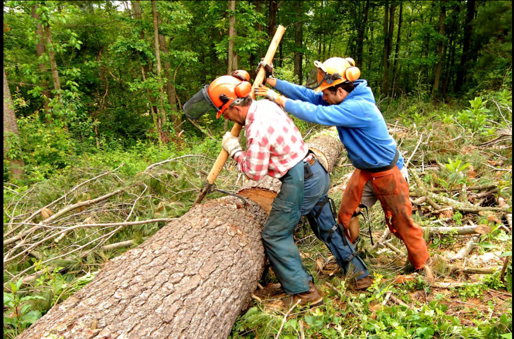
Turner HD Media