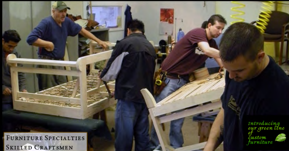
FURNITURE SPECIALTIES SKILLED CRAFTSMEN

Introducing our green line of custom furniture