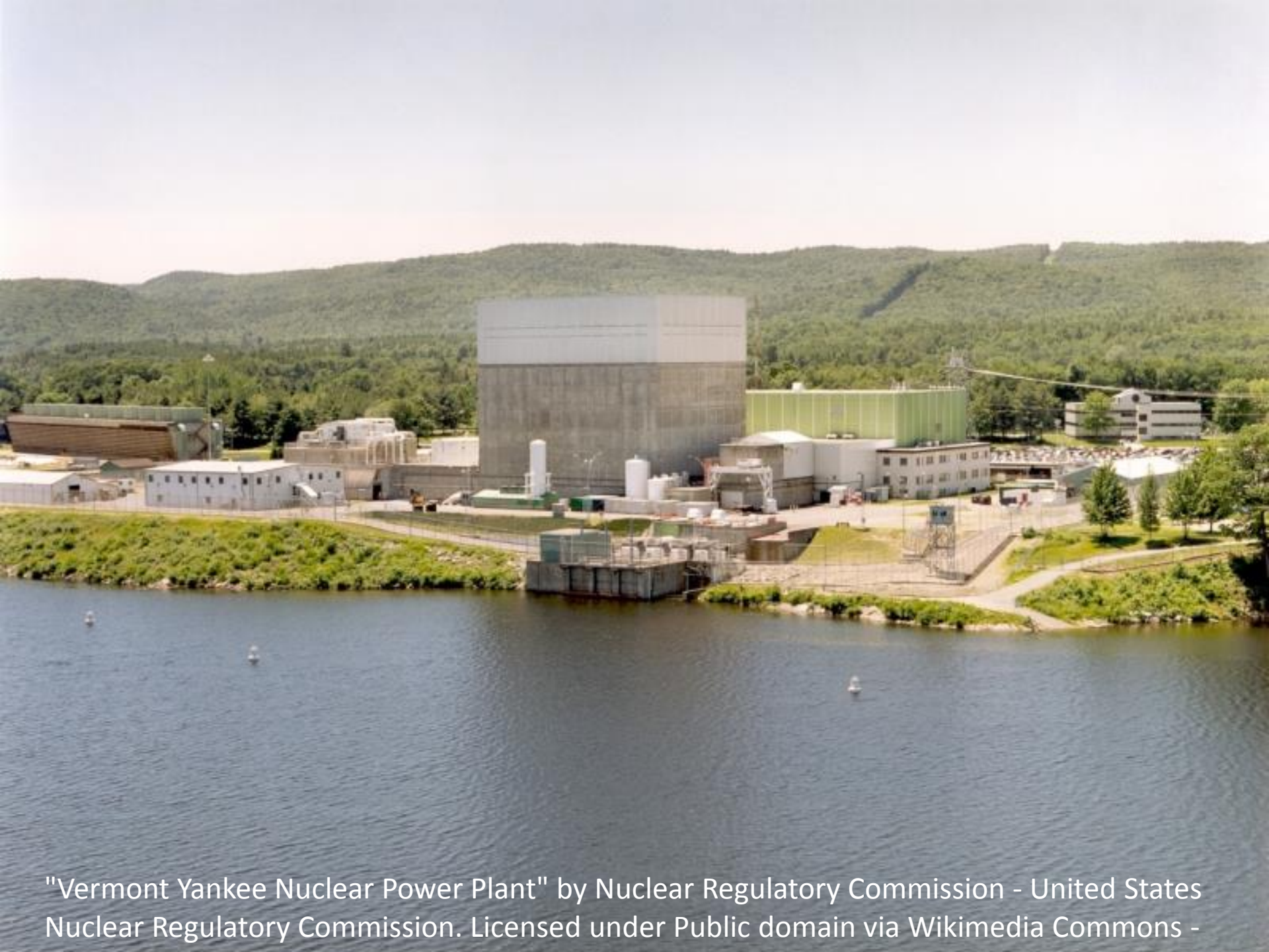
"Vermont Yankee Nuclear Power Plant" by Nuclear Regulatory Commission - United States Nuclear Regulatory Commission. Licensed under Public domain via Wikimedia Commons -