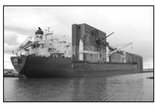
to make investment decisions Over 1,000 vessels each year visit the Port of that address freight-related needs. Duluth-Superior.

The Northern Minnesota/ Northwest Wisconsin Freight Plan was developed by the Arrowhead Regional Development Commission and Duluth-Superior Metropolitan Interstate Council to analzye current and projected freight trends. The information in the plan will assist decision-makers to make investment decisions that address freight-related needs These projects will support job