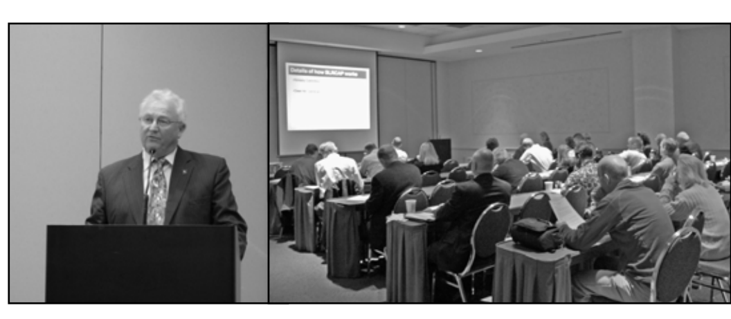
In Fall 2009, Bi-State Regional Commission held a Transportation Alternatives and Air Quality Summit to launch a voluntary Clean Air Partnership, a coalition of public and private entities working together to address high levels of ozone and particulate matter.

The Bi-State Regional Commission (BSRC) initiated the regional Aware of Air Program to improve local knowledge of air quality issues using Congestion Mitigation/Air Quality (CMAQ) funding. Although the area currently meets federal air quality standards, future growth and development could increase emissions and cause air quality problems. With the Aware of Air Program spanning the region's MPO and its rural areas, BSRC has used multi-media advertising to educate households about transportation and air quality, marketed regional transit services, and developed a regional transit web portal. In addition, BSRC hosted a regional Transportation Alternatives and Air Quality Summit and the launch of Bi-State Region Clean Air Partnership to facilitate voluntary emission reduction activities by local governments, businesses and organizations. Future steps may include conducting a targeted land use analysis to encourage further emission reductions for ozone and fine particulates.