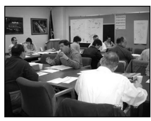
The Rural Transportation Planning Committee discusses priority projects.

To implement the statewide Land Use, Transportation and Economic Development (LUTED) program, North Central Pennsylvania Regional Planning and Development Commission conducted the Operationalizing Plans for Project Prioritization initiative. The project translates planning directions contained in the Regional Action Strategy, Long-Range Transportation Plan, Comprehensive Economic Development Strategy and other plans into selection criteria. These