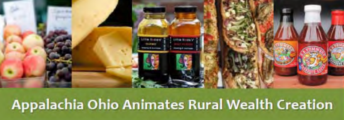
Appalachia Ohio Animates Rural Wealth Creation