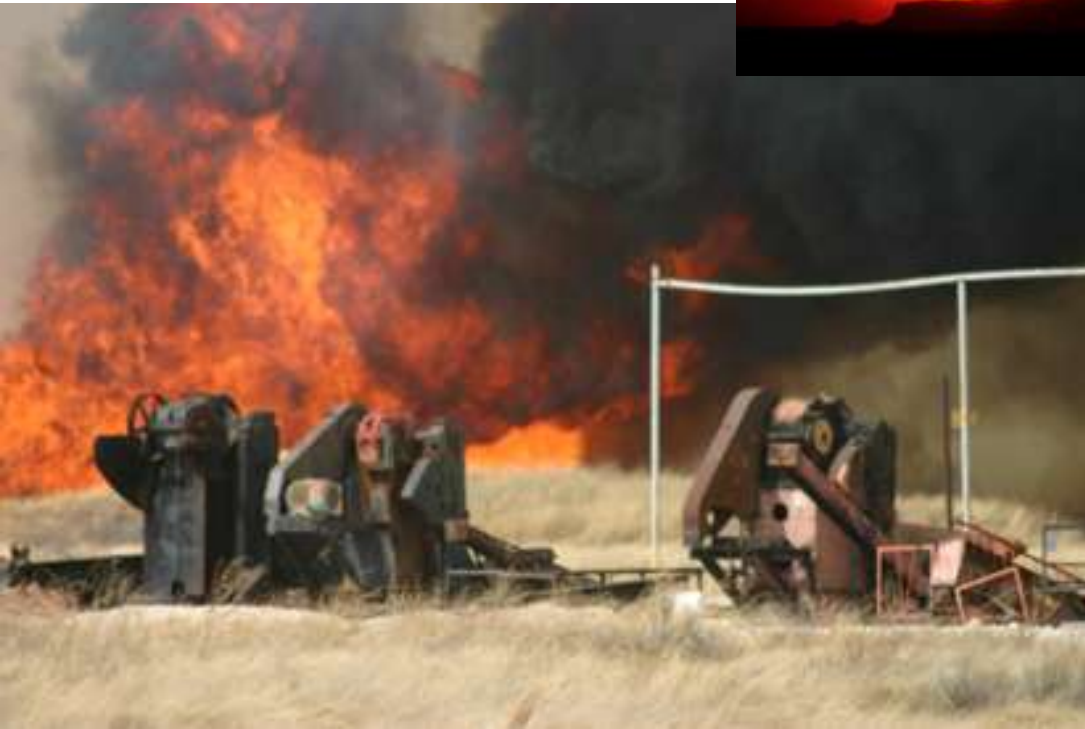
Cheyenne Fire, Hockley County, Texas