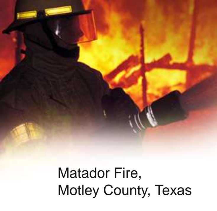
Matador Fire, Motley County, Texas