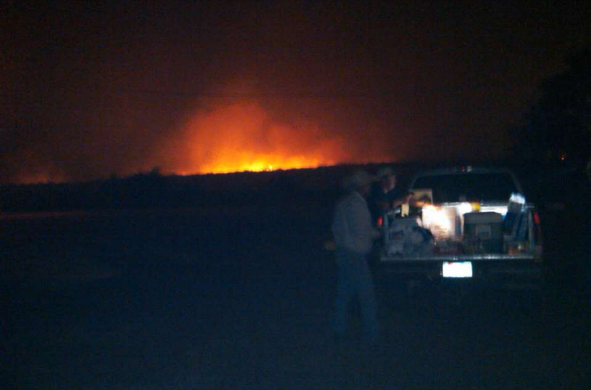
Dickens Complex Fire, Dickens & King County, Texas