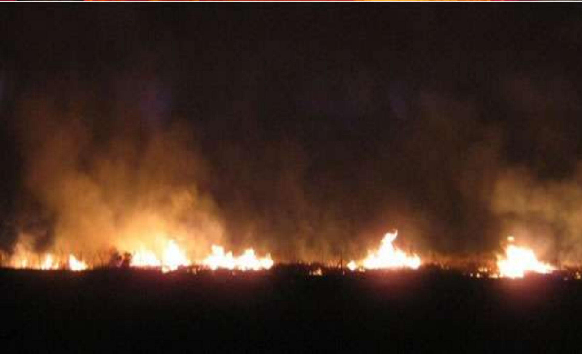
Dickens Complex Fire