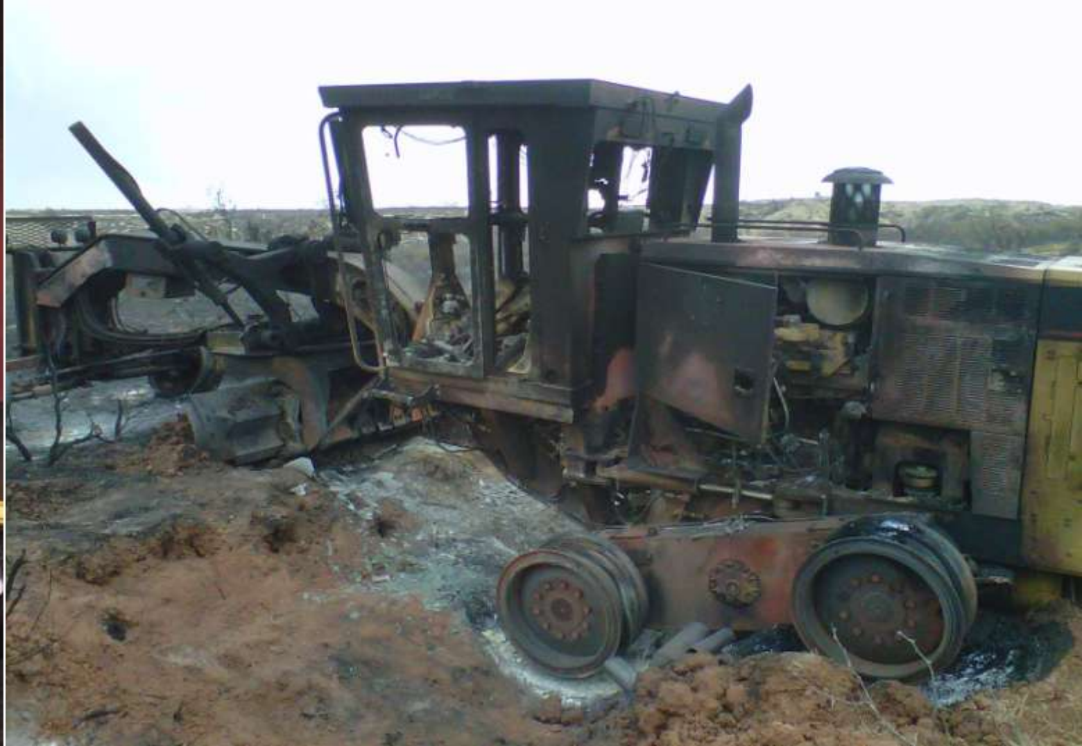
Richardson Fire, Garza County, Texas