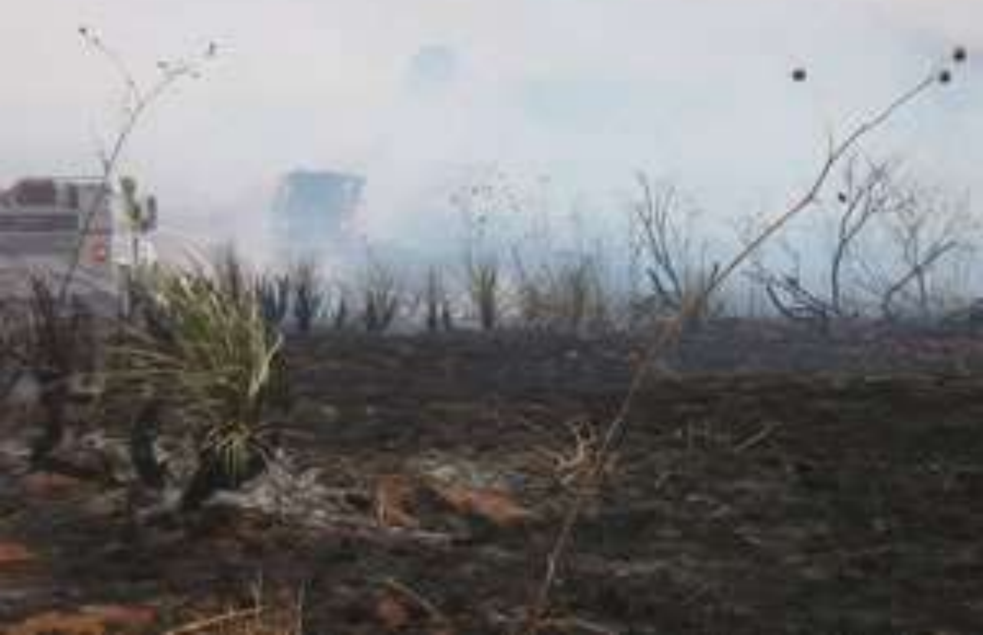
Dickens Complex Fire, Dickens County, Texas