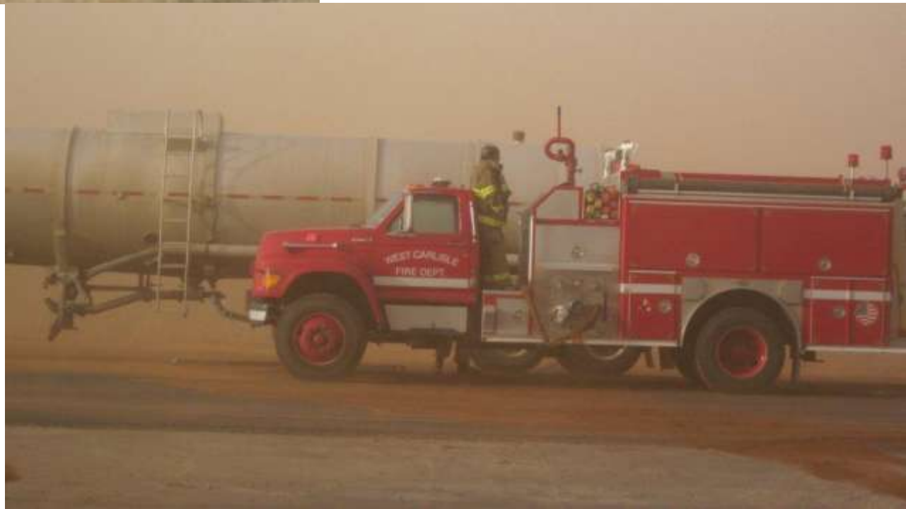
Sundown Highway Fire, Hockley County, Texas