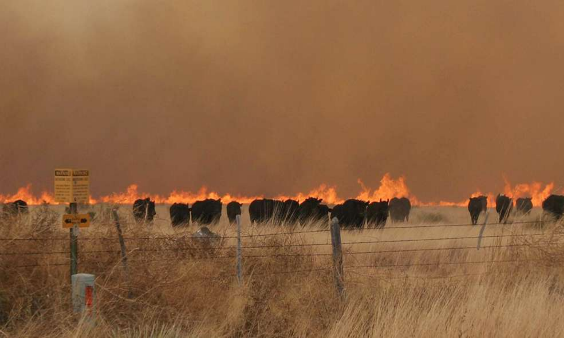
Swenson Fire, King County, Texas