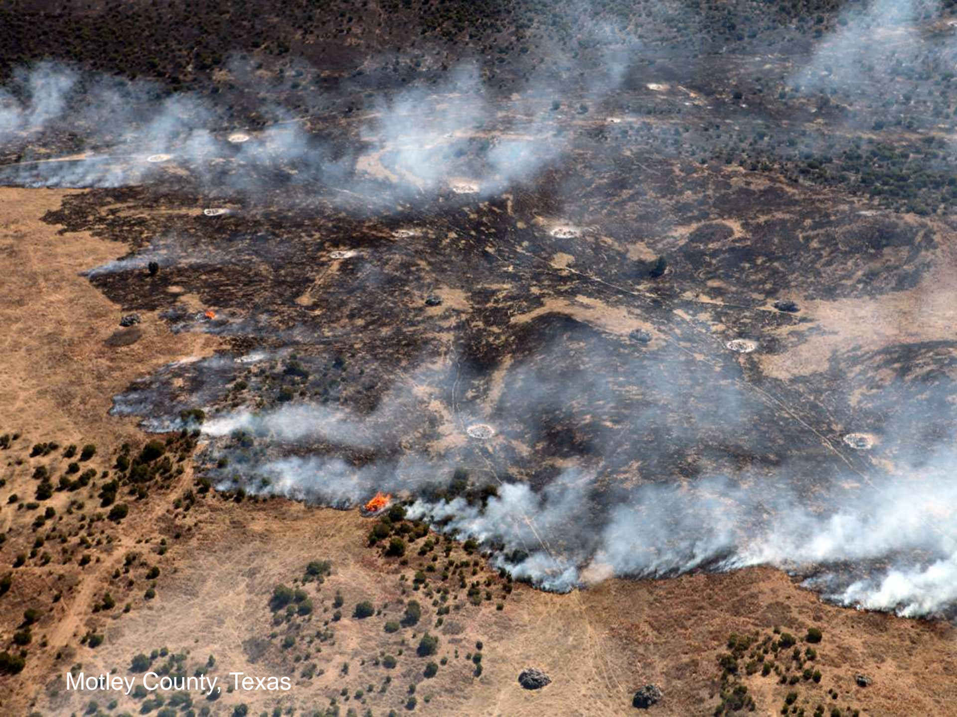
Motley County, Texas