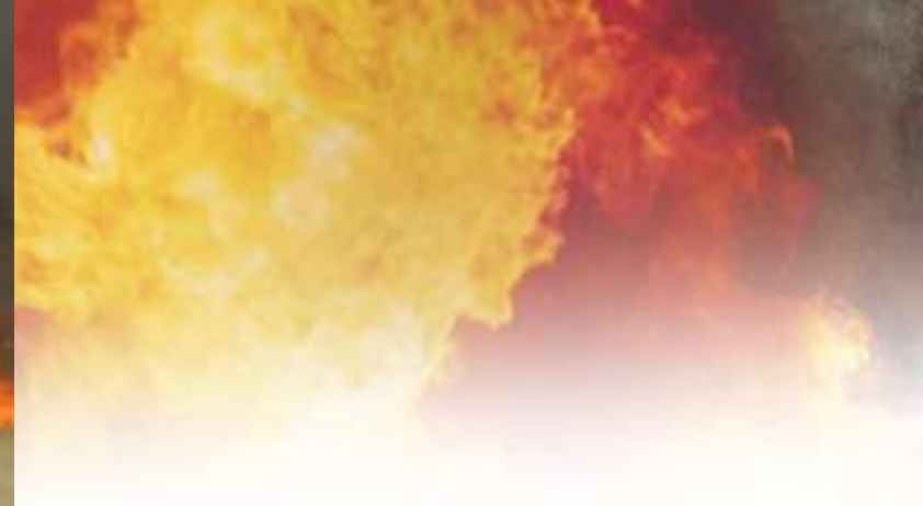
Fathers Day Fire, Cochran County, Texas