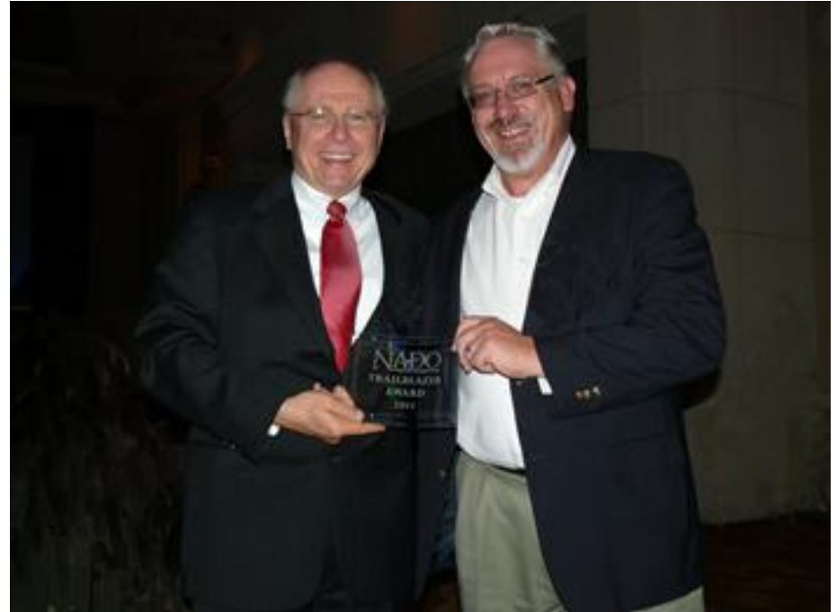
NADO Trailblazer Award 2011