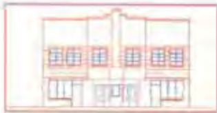
Artis Palmer Community Center