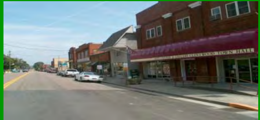
Store Fronts and Sidewalks