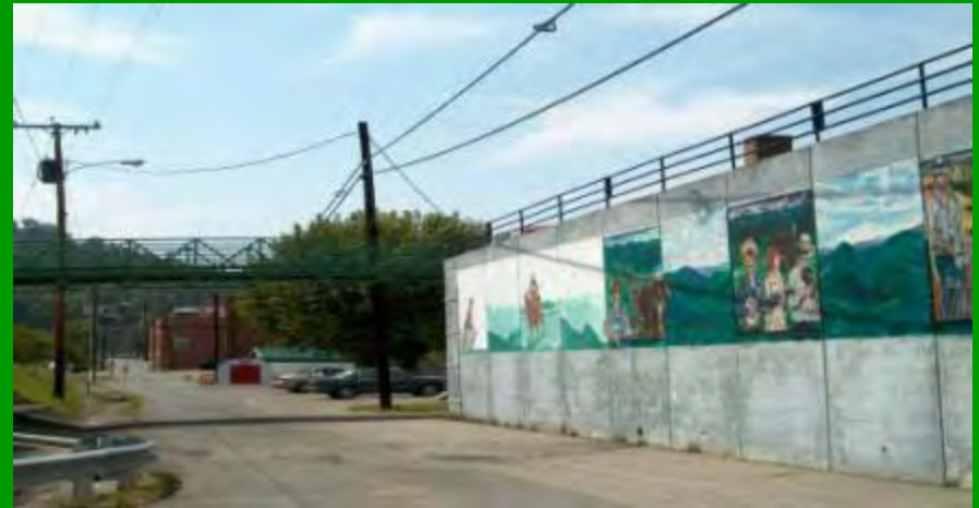
Murals and Pedestrian Bridge