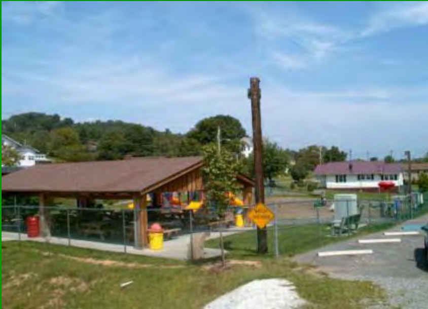
Kids Corner Park