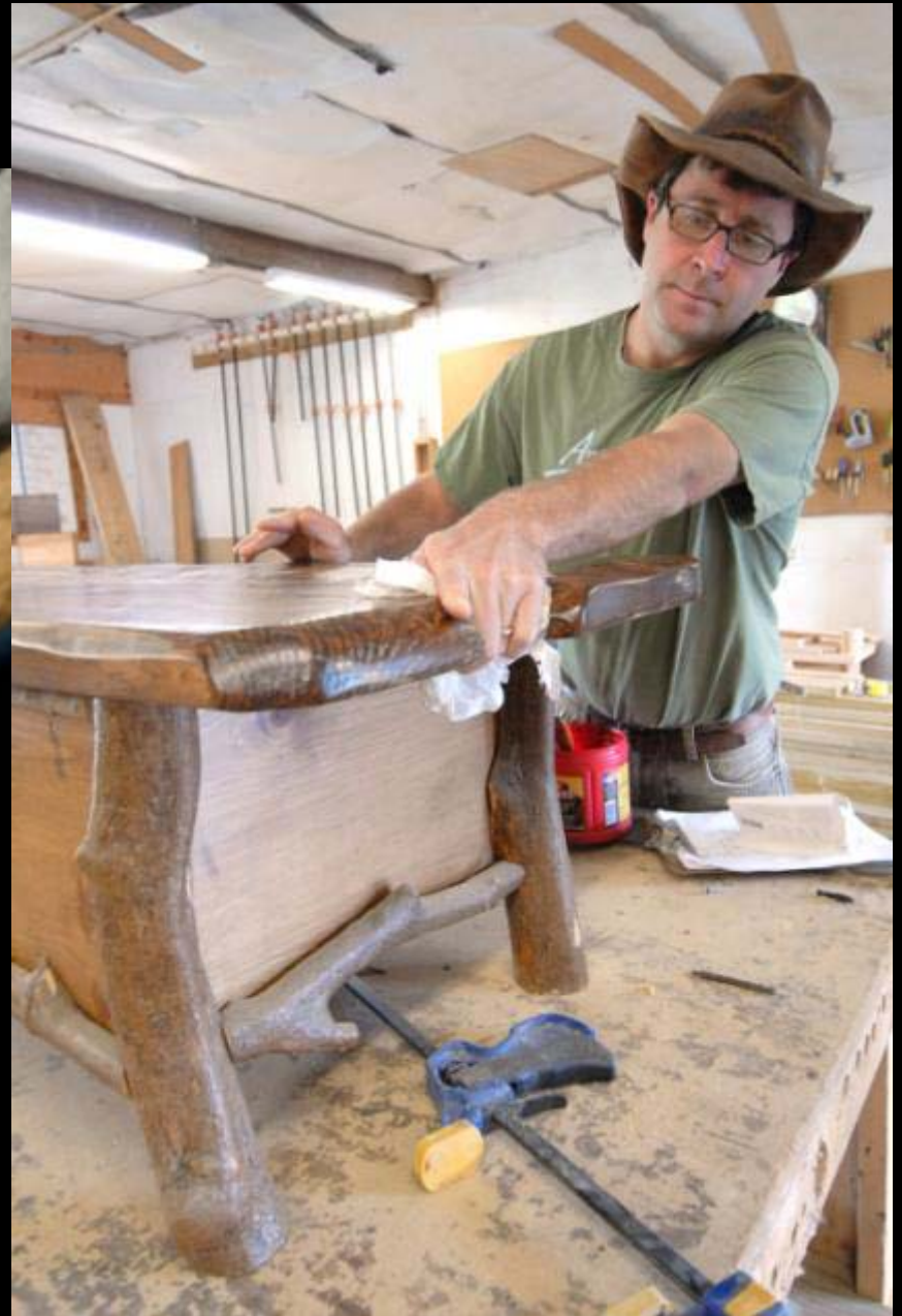
Turner HD Media