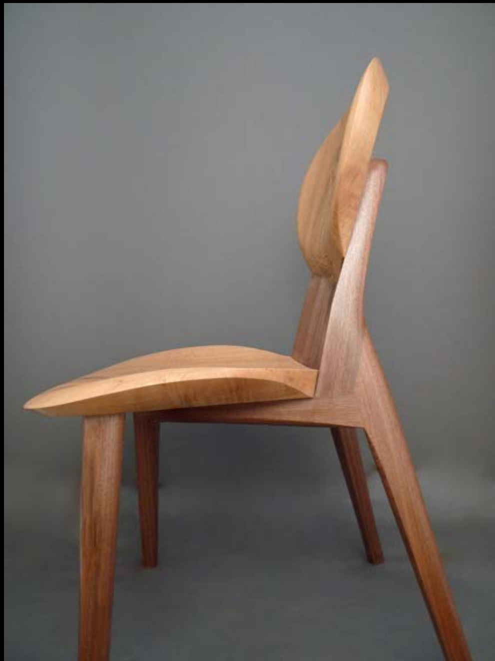
The Boggs Collective