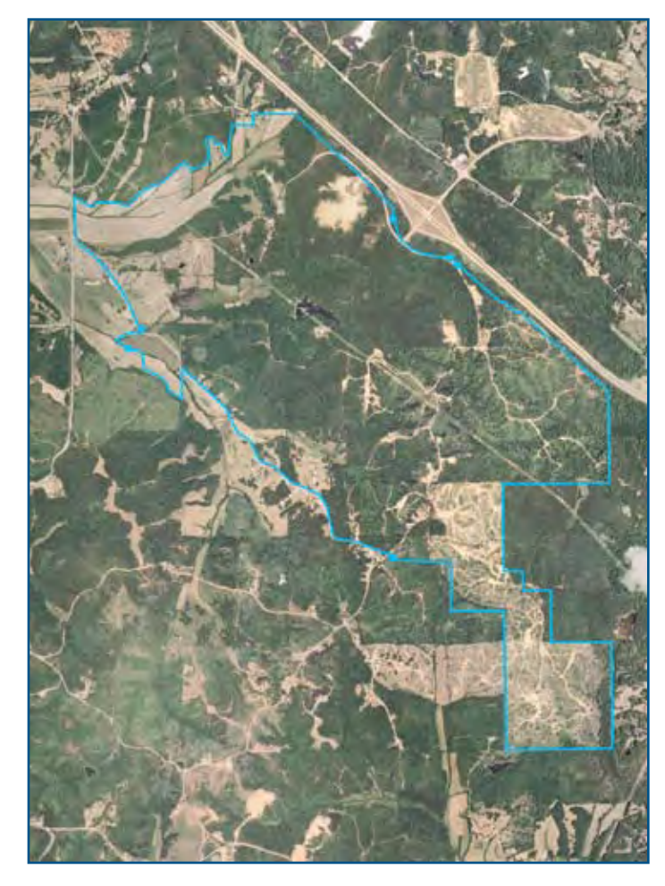
Aerial view of the Wellspring Site in Blue Spring, Mississippi.

After explaining the Alliance's goal, Kelley made this appeal: "We know that your grandparents may have lived here. We're asking you