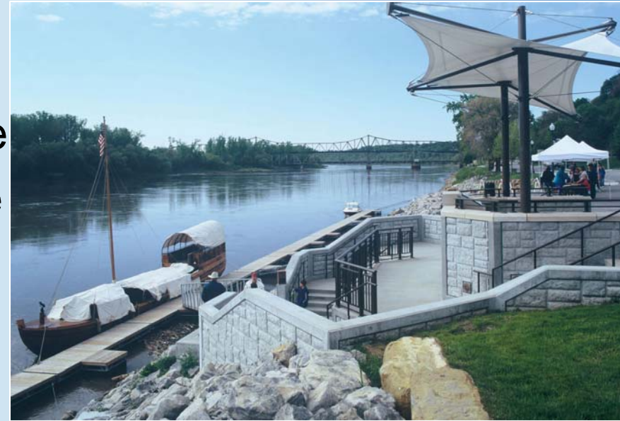
The revitalized Lewis and Clark Riverfront Landing in Atchison, Kansas