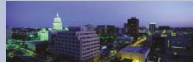
2007 TRAINING CONFERENCE • AUGUST 25-28 • AUSTIN, TX