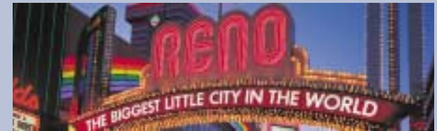
2006 TRAINING CONFERENCE • AUGUST 26-29 • RENO, NV

The Washington Policy Conference , held each spring in the nation's Capitol, features a chance to network one-on-one with federal agency officials and congressional leaders. It also offers expert panels on federal budget and policy issues, plus participants receive talking points, policy briefs and other materials needed to communicate effectively with federal lawmakers and policy officials.