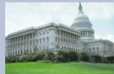
WASHINGTON, DC POLICY CONFERENCE