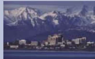
2008 TRAINING CONFERENCE • OCTOBER 4-7 • ANCHORAGE, AK